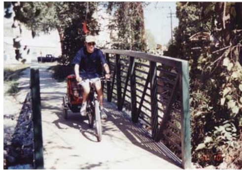
Father and child riding one of the trails together.