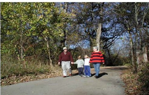
A family taking a walk on one of the city's trails.