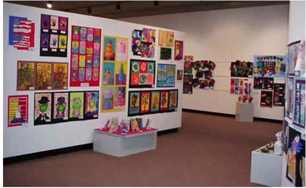
A portion of the works in the elementary division of the 2010 All School Exhibition held at the Springfield Art Museum. —————