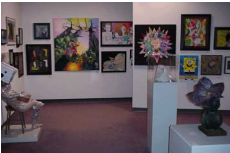
A portion of the works in the high school division of the 2010 All School Exhibition held at the Art Museum. —

After thirty hours of training, they will be ready for the annual fifth grade busing program sponsored by Southwest Missouri Museum Associates. They will be profiled in future newsletters so that you can become familiar with them.