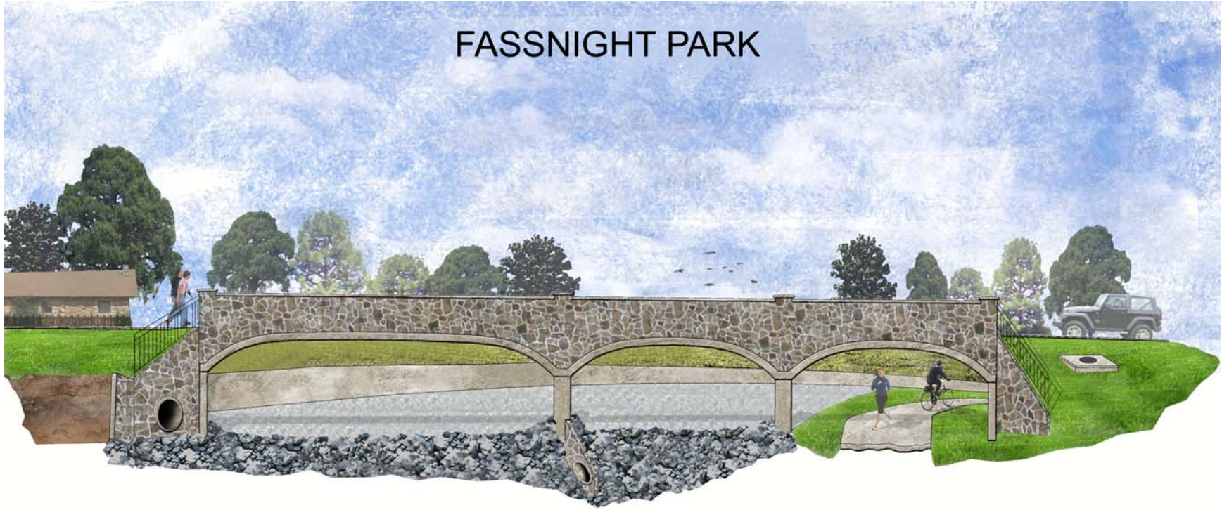
WEST ELEVATION 98' 3-SPAN BRIDGE CAMPBELL AVENUE STRUCTURE