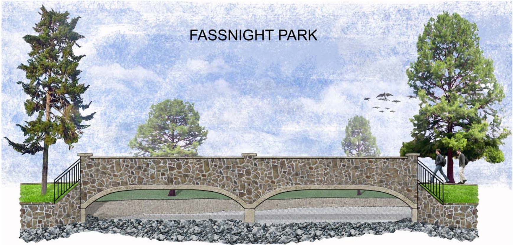
WEST ELEVATION 68' 2-SPAN BRIDGE MAIN AVENUE STRUCTURE