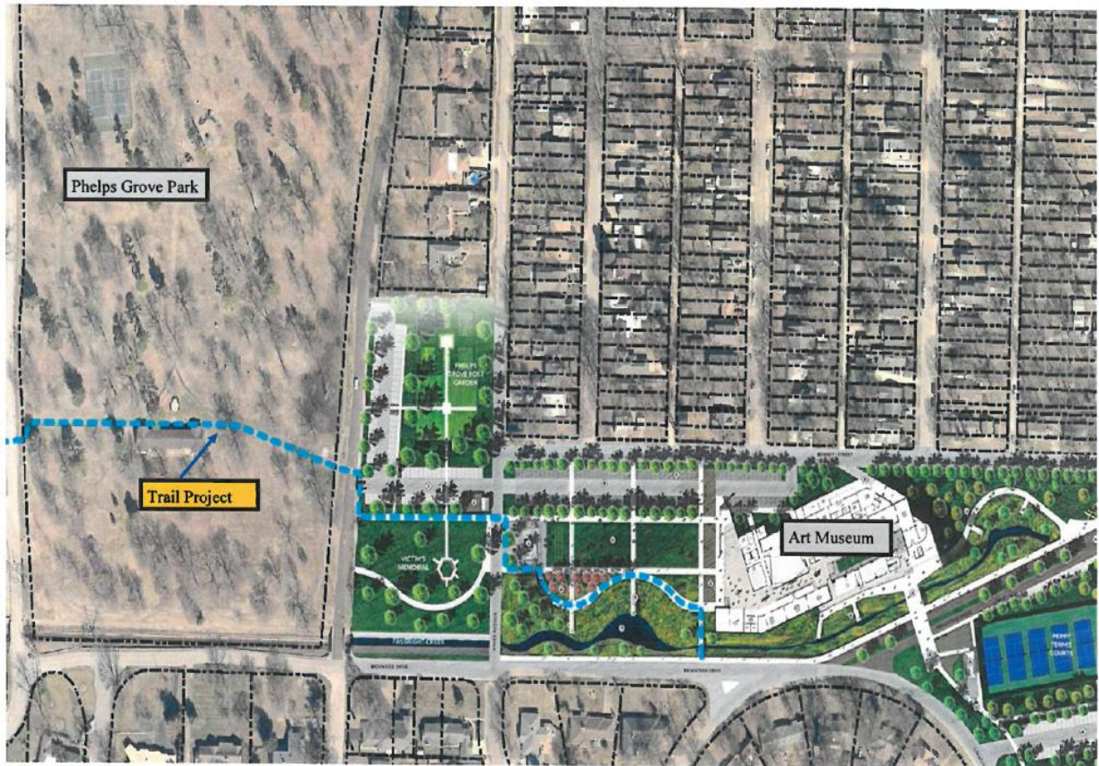
Exhibit A - Location of Project