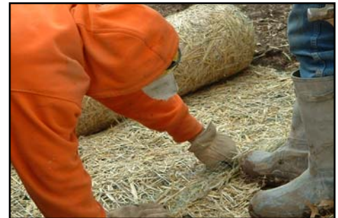
Staking of an erosion control blanket

Several factors, such as soil conditions, steepness and length of slope, depth of flow, runoff velocities, and time required to establish desired vegetation influence the choice of product. Manufacturer's recommendations should be followed. Products are available for a variety of uses: Netting-synthetic or natural fiber mesh installed over disturbed areas to hold organic mulch and/or seed in place, biodegradable erosion control blanket-natural fiber blanket held together by netting to provide temporary erosion protection on slopes and channels, and permanent erosion control blanket-synthetic blanket material which provides permanent erosion control on slopes and channels with increased water flow velocities.