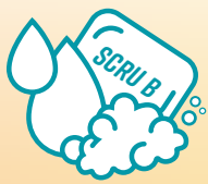
SOAP & WATER